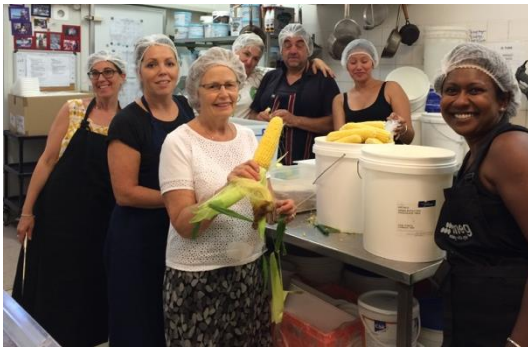
Tricky to empty and labour intensive to