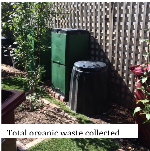
Total organic waste collected

wheel backwards and forwards. Filling the polystyrene corn boxes and taking to school by car was easier.