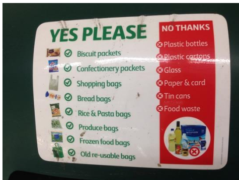
Label above used on soft plastics bins